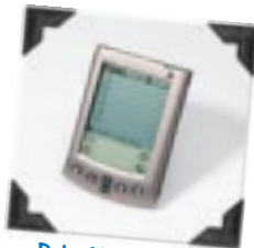
Palm V Organizer