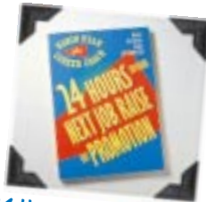
24 Hours to Your Next Job, Raise or Promotion