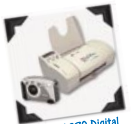
Kodak DC280 Digital Camera and PM100 Printer

✓ Kodak PM100 Printer allows you to quickly create vivid color pictures with the push of a button.