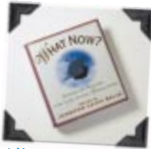
What Now? Words of Wisdom For Life After Graduation