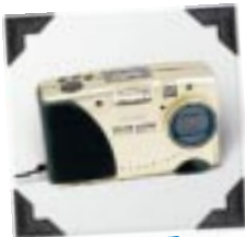
Kodak DC215 Zoom Digital Camera

Who enjoys receiving gifts more? Grads or Dads? Both! So at eHow.com, we've compiled a great group of possible Graduation and Father's Day gift ideas, from laptop and desktop computers, to power tools and career-boosting books. Here's a sampling of them. For much, much more, visit the Grads & Dads Center at www.ehow.com .