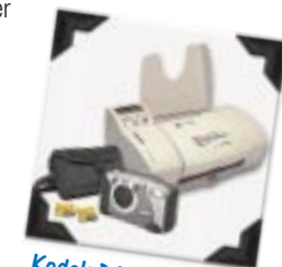
Kodak DC280 Digital Camera Premium Bundle and PM100 Printer

Weekly Sweepstakes: Win a Kodak DC280 Zoom Digital Camera and a Kodak Personal Picture Maker PM100 Printer by Lexmark.