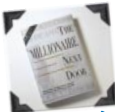
The Millionaire Next Door