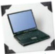
Compaq Presario Notebook Computer